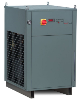
FlowCool Unicus (with option colour RAL 7043 - traffic grey B)