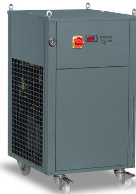
FlowCool Unicus (with option castors)