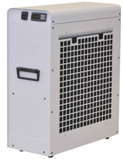
ProfiCool Primus PCPR 020